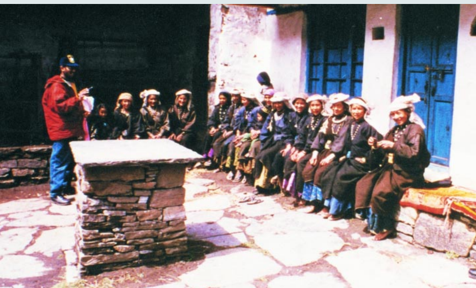
FIGURE 4 A women's self-help group analyzes the impacts of the Reserve on their lifestyles and perceptions.

property and produce due to wildlife depredation (13%). While women (constituting about 10% of those surveyed; see Figure 4) gave loss of subsistence needs as the primary reason (100%), most male respondents (60%) cited loss of economic opportunities (Table 1).