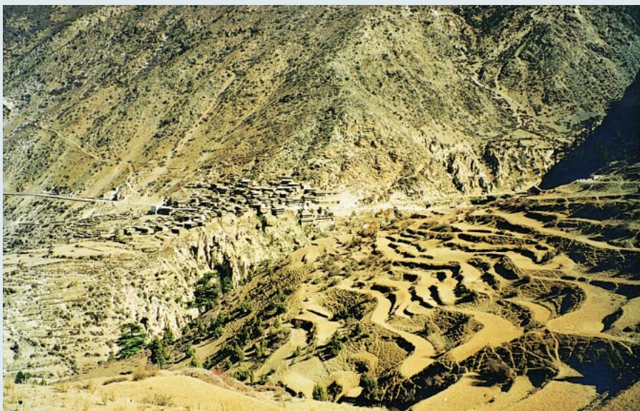
FIGURE 3 As the village of Malari in the buffer zone of the Reserve is in the rain shadow zone, an extensive irrigation system was developed using snowmelt waters from streams.