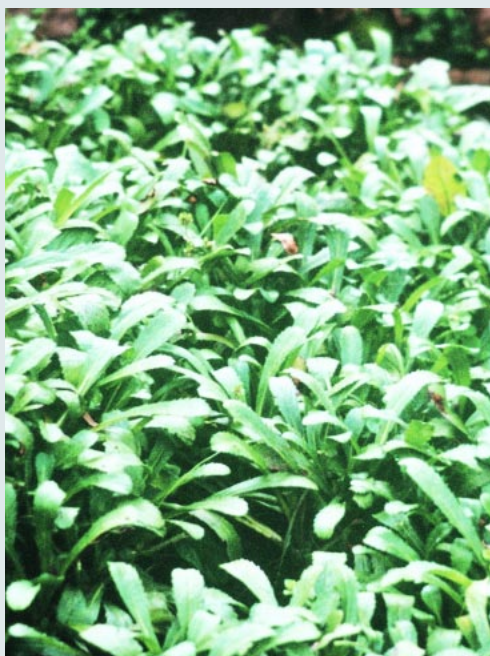
FIGURE 5 Picrorhiza kurrooa , a medicinal plant cultivated in the buffer zone villages of the Reserve, has a potential to mitigate conflict by reducing the total area needed to meet the cash requirements of the local inhabitants. About 25 such species are now being domesticated and 11 are being cultivated by local people.

Studies conducted by the authors on cropping patterns suitable for the region and on the function of village ecosystems suggest that a drastic modification of agriculture is needed to produce nonpalatable medicinal and aromatic plants suitable to local conditions (Figure 5). Such crops are fetching high monetary returns on small sites near inhabited areas where protection measures could easily be taken. As the produce is of high value and is generally non-